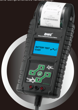
BT2000EV Golf Cart Battery Analyzer